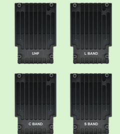
ULSC Modular Amplifier