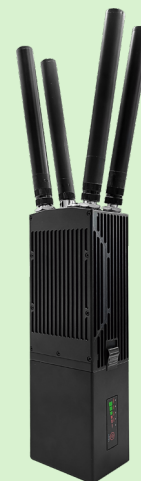
Dual-band Operation Simultaneously/ ULSC Four-band Selection Operate